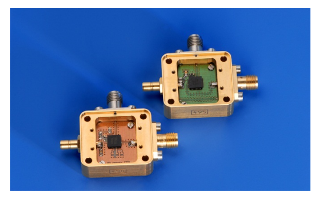
Figure 2: 15 GHz VCO

For the Fraunhofer Institute, the ProtoLaser S was the perfect fit. Providing accurate, versatile processing technology while prototyping at the speed of laser, the ProtoLaser S has enabled the Fraunhofer Institute to make its mark on closing the terahertz gap.